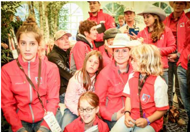
RIDERS & HORSES AT THE VET CHECK, GETTING INSPECTED FOR TODAY'S WORLD CHAMPIONSHIPS JUNIOR & YOUNG RIDERS